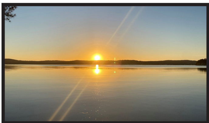
Sunrise on the last morning