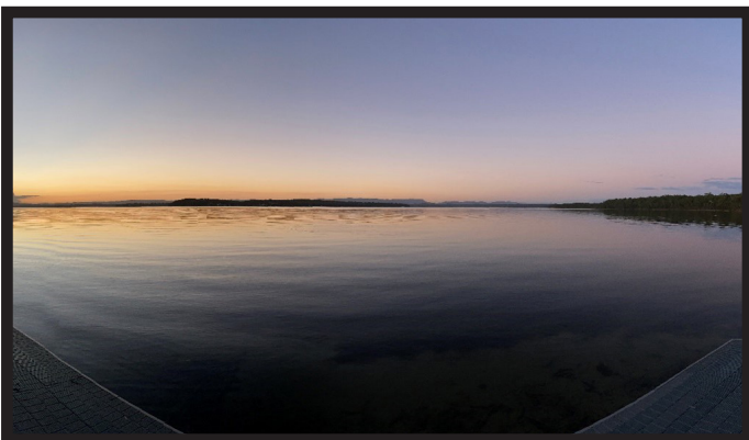
Sunset on the last night over the water